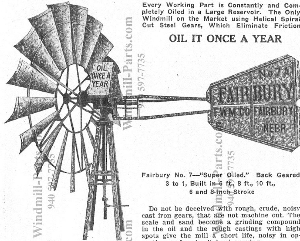
Fairbury No. 7—"Super Oiled." Back Geared 3 to 1, Built in 6 ft., 8 ft., 10 ft., 6 and 8-Inch Stroke

Do not be deceived with rough, crude, noisy cast iron gears, that are not machine cut. The scale and sand become a grinding compound in the oil and the rough castings with high spots give the mill a short life, noisy in operation, and make it hard running.